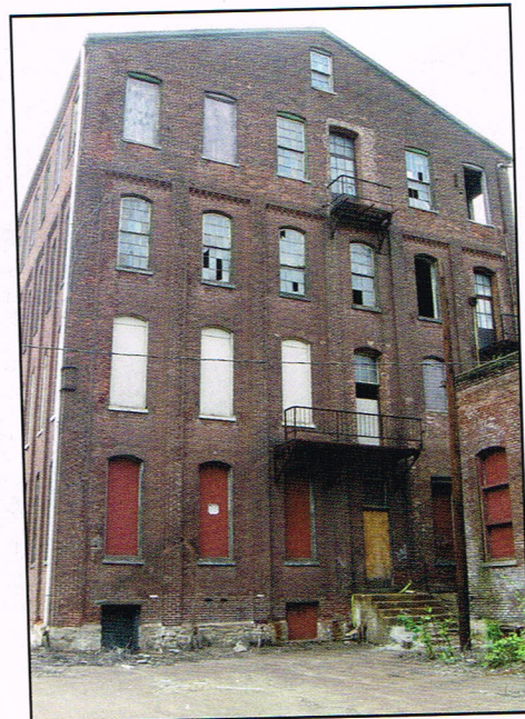
Typical Building Elevation.