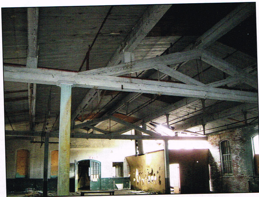
Queen Post Truss Spanning Between Gable Truss.

The results of the condition assessment indicated that most of the existing structures were in relatively fair to good condition and appeared to have adequate structural capacity to enable their adaptive reuse as residential, educational, office, retail, light storage or light manufacturing facilities. The existing buildings, however, did require a considerable amount of structural repair work to assure their safe use and continued service life. The total estimated cost to complete the structural repairs recommended by the investigation was approximately $3 million.