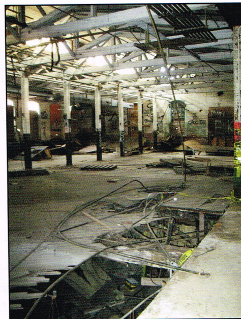
Collapsed 1 st Floor Framing over Basement.