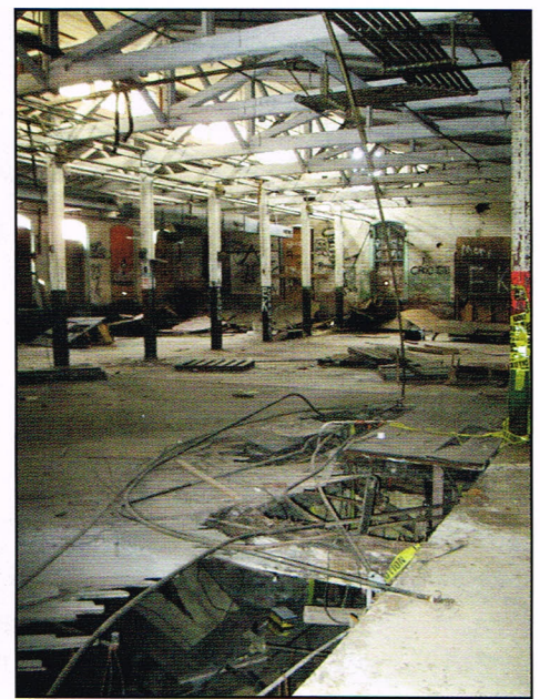
Collapsed 1 st Floor Framing over Basement.